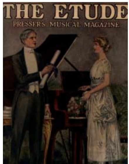
For the graduate. Illustration by Wm. S. Nortenbeim ( The Etude , June 1919).