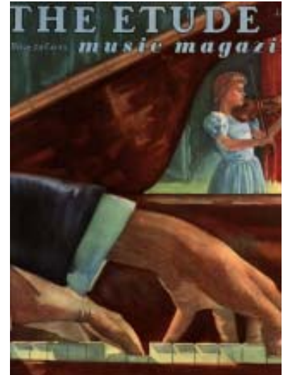
Suitable for framing. Issues of The Etude magazine dating back to 1919 will be on sale at the upcoming holiday recital. The cover of the January 1946 issue is by M. Santa Maria.